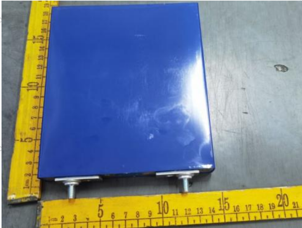
Figure 3 Overall view of cell (电芯外观图)