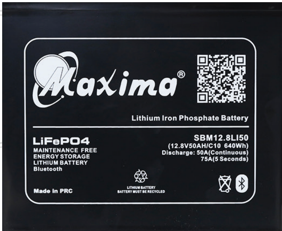
Figure 4 Battery label (电池标签)