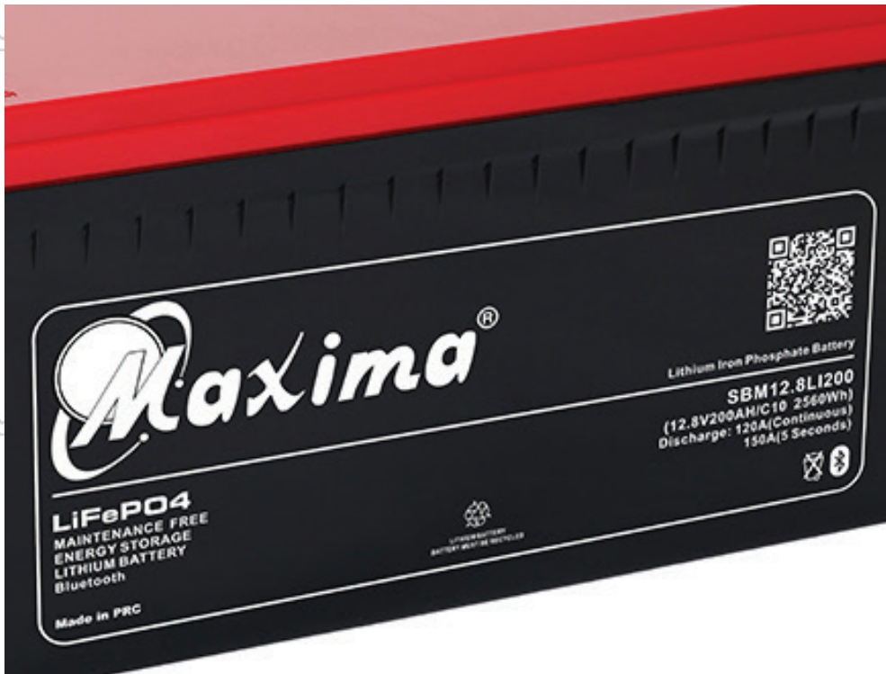
Figure 4 Battery label(电池标签)