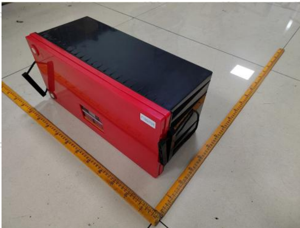
Figure 2 Overall view II of battery(外观图I)