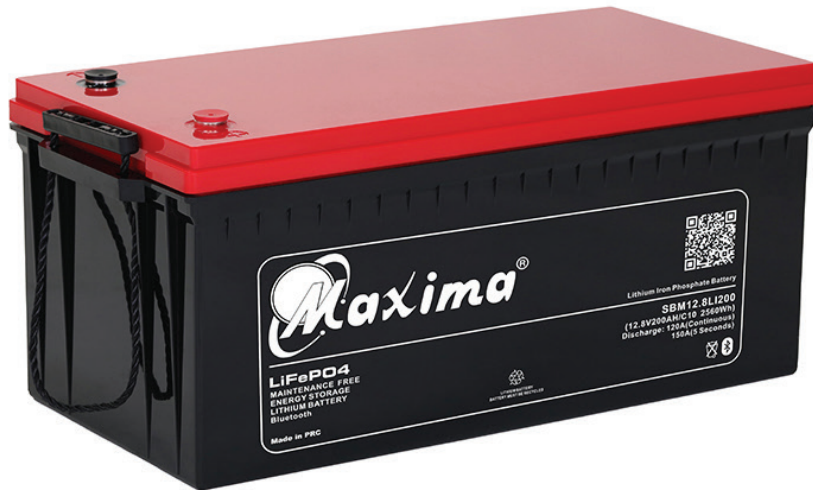
Figure 1 Overall view I of battery(外观图1)