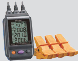
DIGITAL PHASE DETECTOR PD3259-50