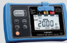
EARTH TESTER FT6031-50