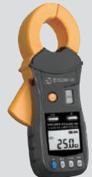
CLAMP ON EARTH TESTER FT6380-50

More compatible HIOKI products and apps are on their way