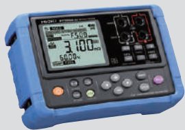
BATTERY TESTER BT3554-50