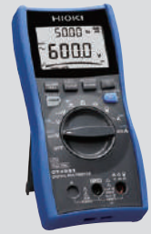
DIGITAL MULTI METER DT4261