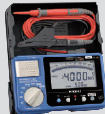
INSULATION TESTER IR4057-50