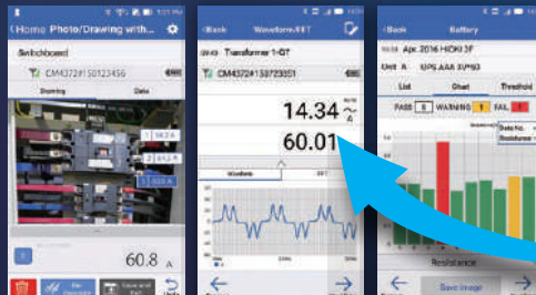
GENNECT Cross App