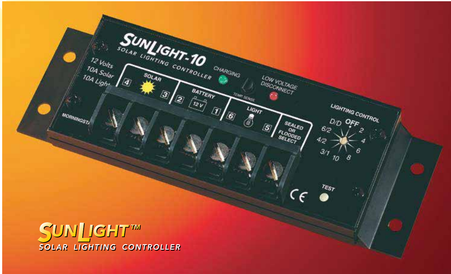
SUNLIGHT™ SOLAR LIGHTING CONTROLLER

Morningstar's advanced SunLight solar lighting controller combines the SunSaver design with a microcontroller for automatic lighting control functions.