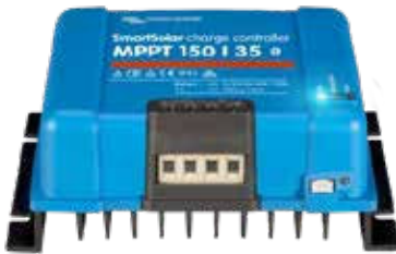
SmartSolar Charge Controller MPPT 150/35