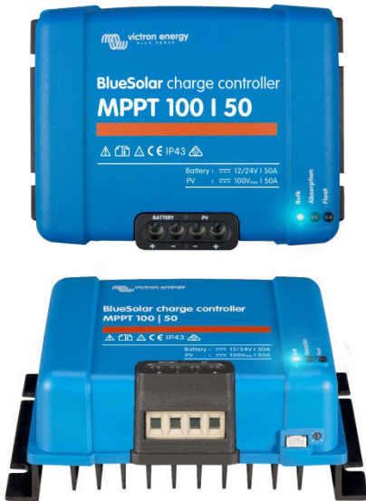
BlueSolar Charge Controller MPPT 100/50