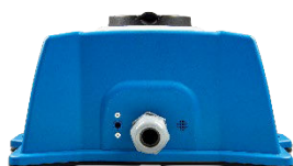
EV Charging Station - Back