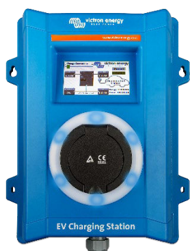
EV Charging Station