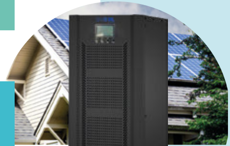
Effective Power Solution Inverter