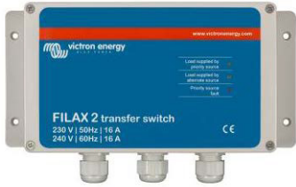
Filax 2: ultrafast transfer switch