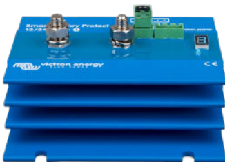
Smart BatteryProtect BP-220