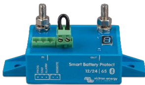
Smart BatteryProtect BP-65