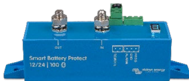
Smart BatteryProtect BP-100