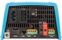
MultiPlus 500 / 800 / 1200 / 1600 VA