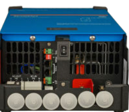
MultiPlus 2000 VA (bottom cover removed)