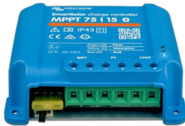
SmartSolar Charge Controller MPPT 75/15