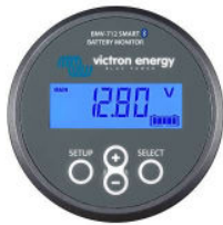
Bluetooth sensing BMV-712 Smart Battery Monitor