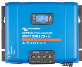
SmartSolar Charge Controller MPPT 250/70-Tr with optional pluggable display