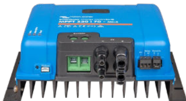
SmartSolar Charge Controller MPPT 250/70-MC4 without display