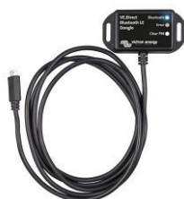
VE.Direct Bluetooth Smart dongle (must be ordered separately)

An excessively high or low battery voltage is indicated by an audible and visual alarm, and a relay for remote signalling.