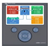
Color Control GX