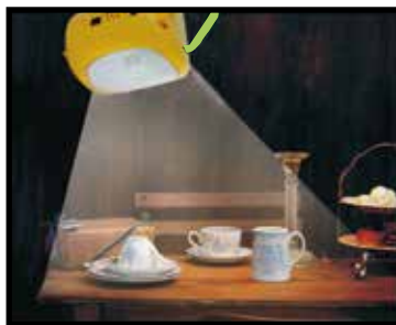
Clean Home Environment